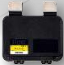
2) TS4-A-O On every module