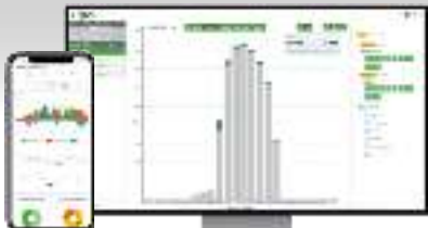
1) Tigo Monitoring 24/7 access incl. installers