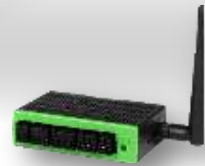
4) Tigo CCA Wireless gateway