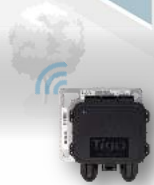
3) Tigo Access Point (TAP) Mesh network – 1 req'd